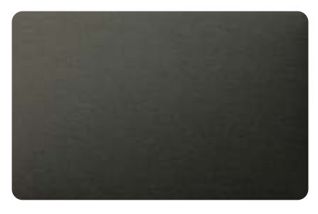
Anodized Look Dark Grey (ES2345)