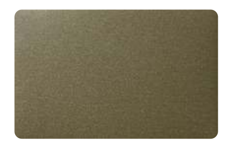
Anodized Look Light Bronze C32 (ES2900)