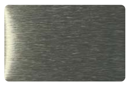
Alunatural Anodic Brushed Glossy 90G (ES1623)