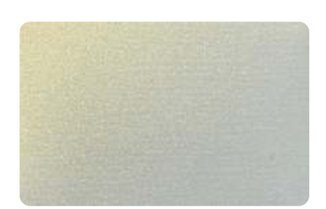
Holo Pure White Gold 90G (ES2357)