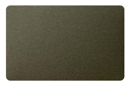
Anodized Look Brown Grey (ES2488)

This catalogue provides general information on Alucoil and their products. Despite having verified all of the information contained in this catalogue, Alucoil does not accept any liability for any errors or printing failures that may lead to material damage, inaccuracies or misunderstandings. All of its contents are for informational purposes only and can be confirmed directly with the company itself.