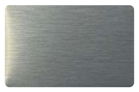
Alunatural Anodic Brushed Satin 60G (ES2026)