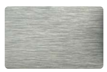
Alunatural Anodic Brushed Matt 10G (ES1757)