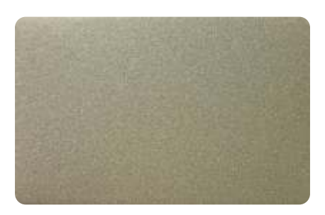
Anodized Look Silver Bronze C31 (ES2290)