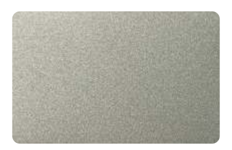
Anodized Look Silver EV1 (ES2920)