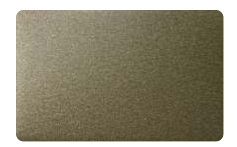
Anodized Look Autumn (ES2902)