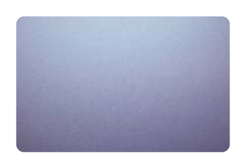
Holo Grey Pink 90G (ES2341)