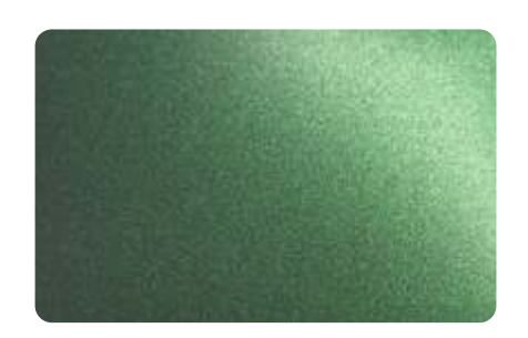
Holo Grey Green 30G (ES3241)