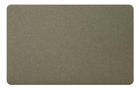
Anodized Look Stone Grey (ES2427)