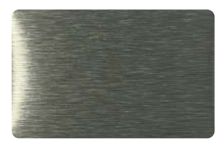
Alunatural Champagne Brushed 90G (ES1581)