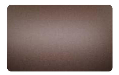
Holo Aged Oxidized Copper 30G (ES2324)