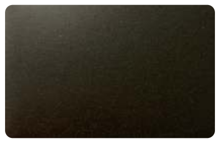
Anodized Look Dark Bronze C34 (ES2368)