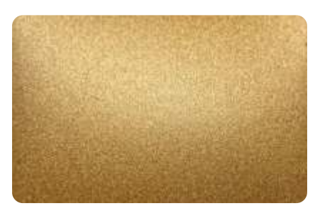
Holo Orange Copper Penny 30G (ES2442)