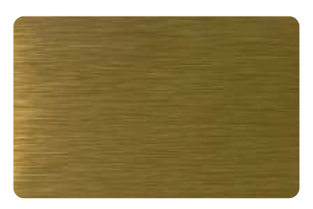
Alunatural Amber Brushed 40G (ES2111)