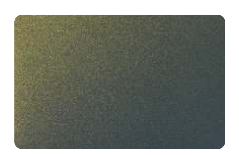
Holo Blue Gold 80G (ES2430)