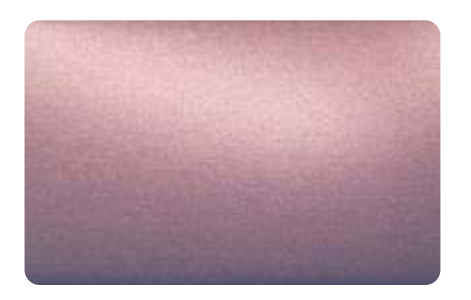
Holo Purple Blue 30G (ES1823)