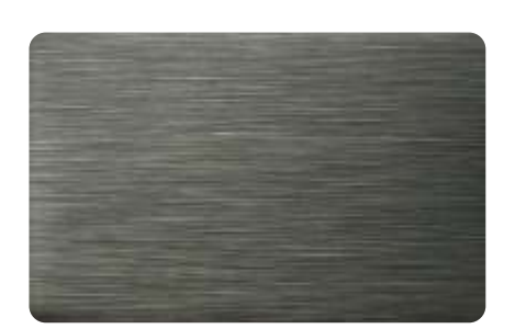
Alunatural Titanium Brushed 10G (ES1370)