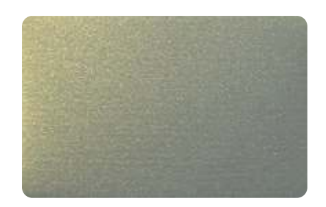
Holo Gold Silver 90G (ES2333)