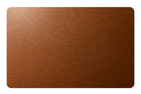
Anodized Look Dark Copper (ES2918)