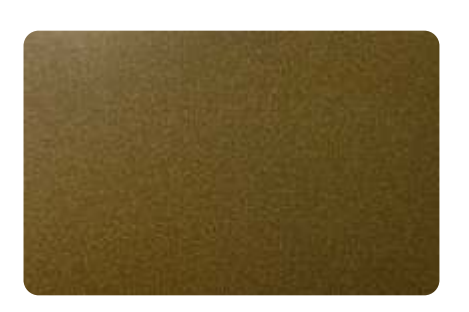
Anodized Look Middle Bronze C33 (ES2917)