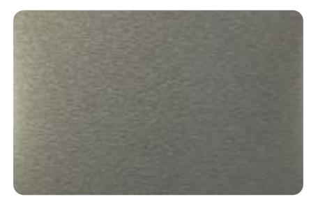
Alunatural Bright TL 90G (ES1448)