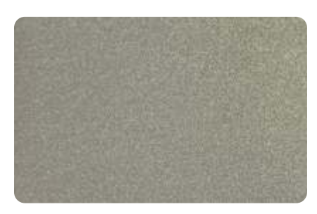
Sparkling Anodic Silver 90G (ES2800)