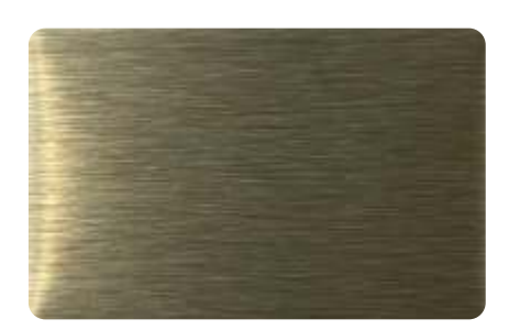
Alunatural Gold Brushed 60G (ES1544)