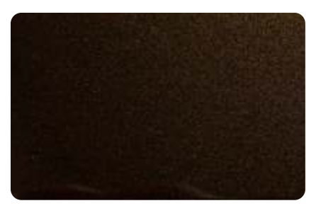
Holo Carnelian Orange Brown 90G (ES2916)