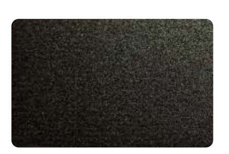
Sparkling Black 90G (ES2351)