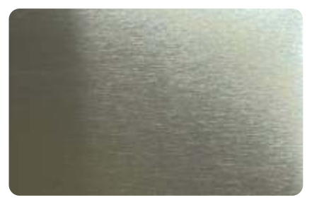
Real Anodized C-Brite 8\mu (ES2017)