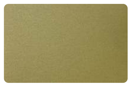
Anodized Look Art Nouveau Gold (ES2919)