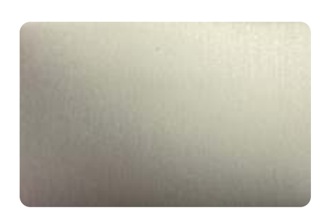
Real Anodized Natural 8\mu (ES1341)