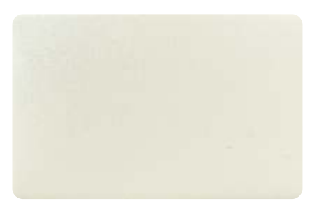
Holo White Silver 90G (ES2216)