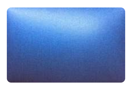
Holo Purple Red 30G (ES2762)