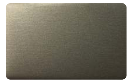
Anodized Look Shadow Grey 9007 (ES2901)