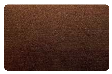
Holo Midnight Copper 90G (ES2356)