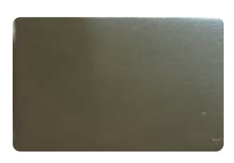
Mirror Architecture (ES1977)